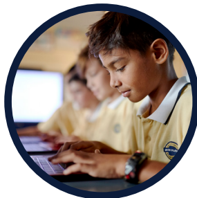
Develop life skills